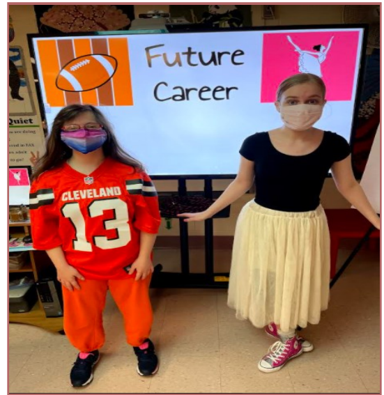
Achieve Students at West Geauga Middle School