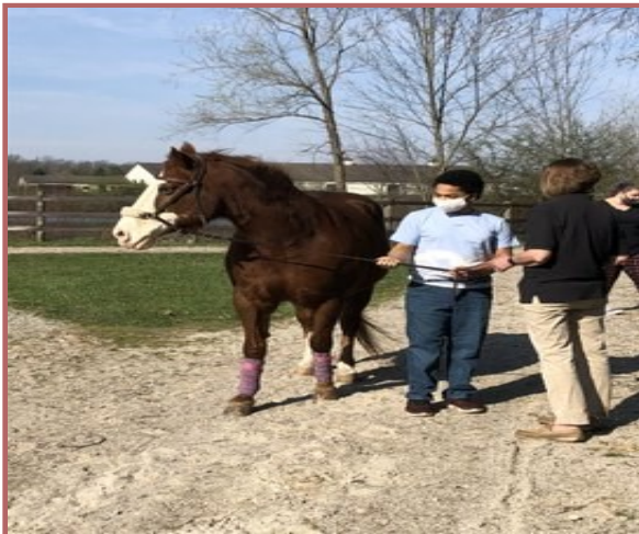
Gaitway High School Students