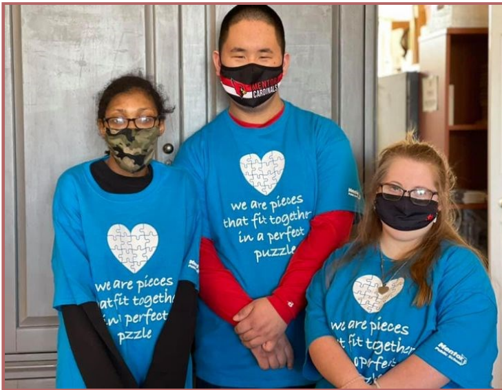
Unique Like Me Students