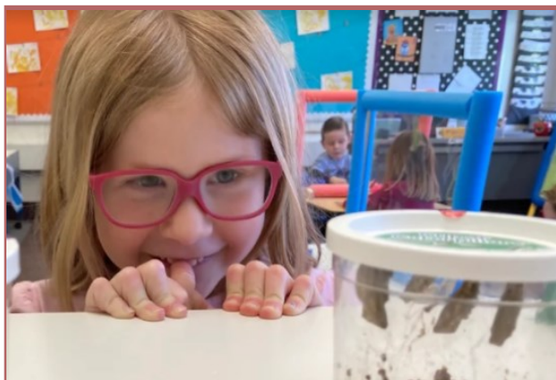
Perry Preschool Students